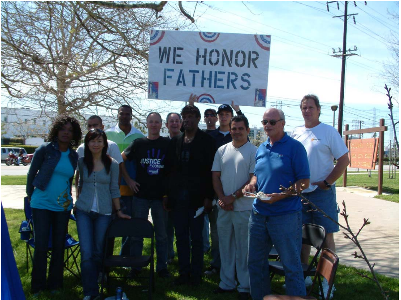
NCFM-LA and Fathers4Justice members, Columbia Park, Torrence, 3/2/08.

On 2/15 and 2/16, NCFM-LA members attended and participated in a historic domestic violence conference in Sacramento with leading domestic violence experts and speakers from around the world who are mostly honest about the dynamics of domestic violence. The conference was a huge success and was standing room only.